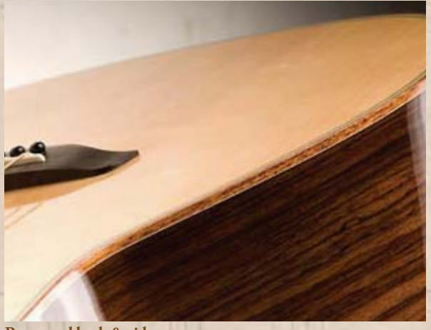
Rosewood back & sides:

The ultimate choice for wide, smooth frequency response with striking lows and sparkly highs