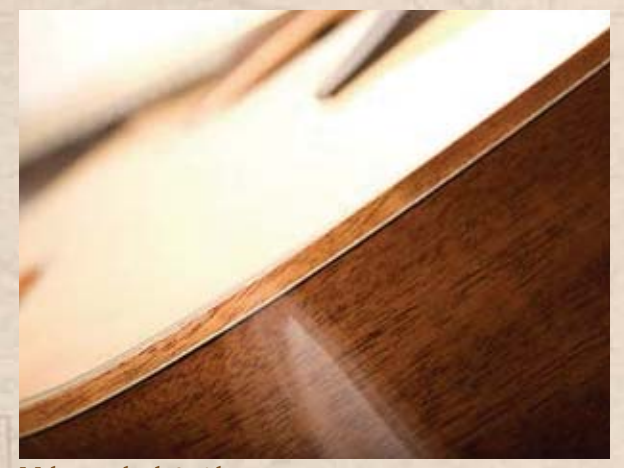
Mahogany back & sides:

The ultimate choice for wide, smooth frequency response with striking lows and sparkly highs