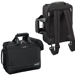
Semi-hard case that can be carried in your hand, over your shoulder, or like a backpack.